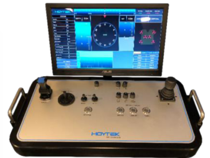
High Tech Industrial Controller