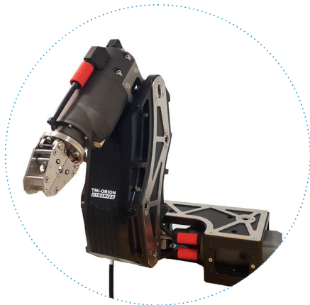
Electrical Manipulator Arm