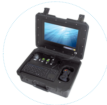
TMI-Orion Dynamics Surface Control Unit

TMI-Orion S.A. Parc Bellegarde - Bâtiment A 1, chemin de Borie 34170 Castelnau-le-Lez - France T.: +33 (0)4 99 52 67 10 – F.: +33 (0)4 99 52 67 19